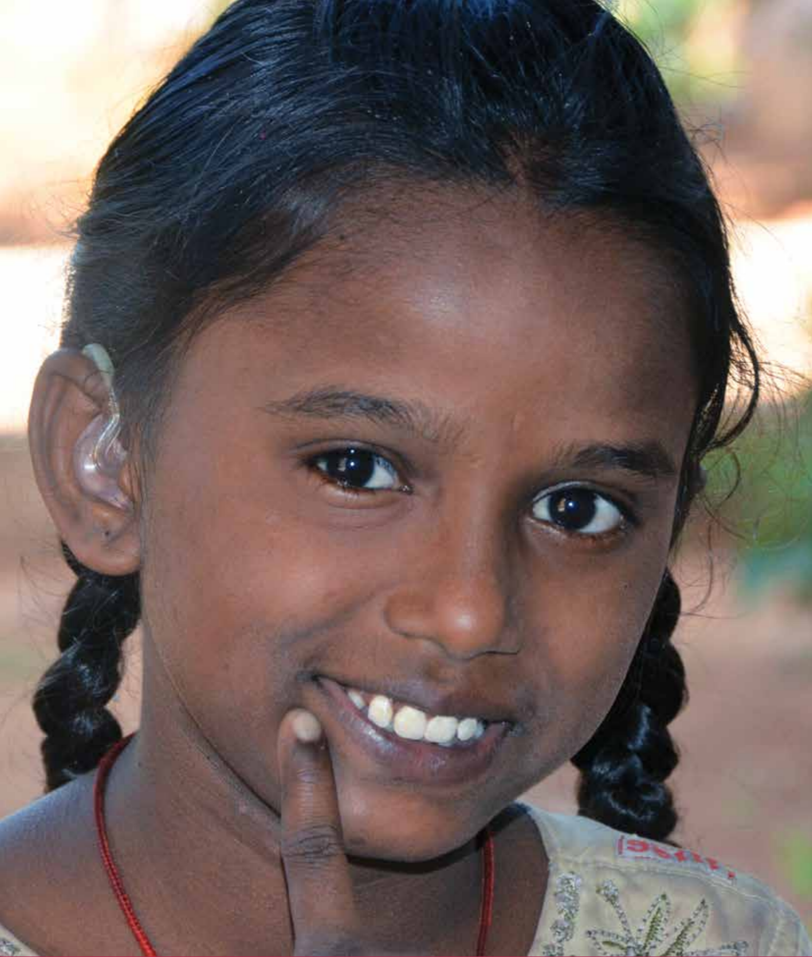
One of the girls provided with hearing aids through the Speech Therapy project