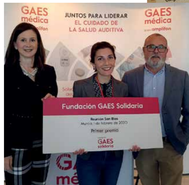
Presentation of the first prize by the GAES Solidaria Foundation at the meeting in San Blas