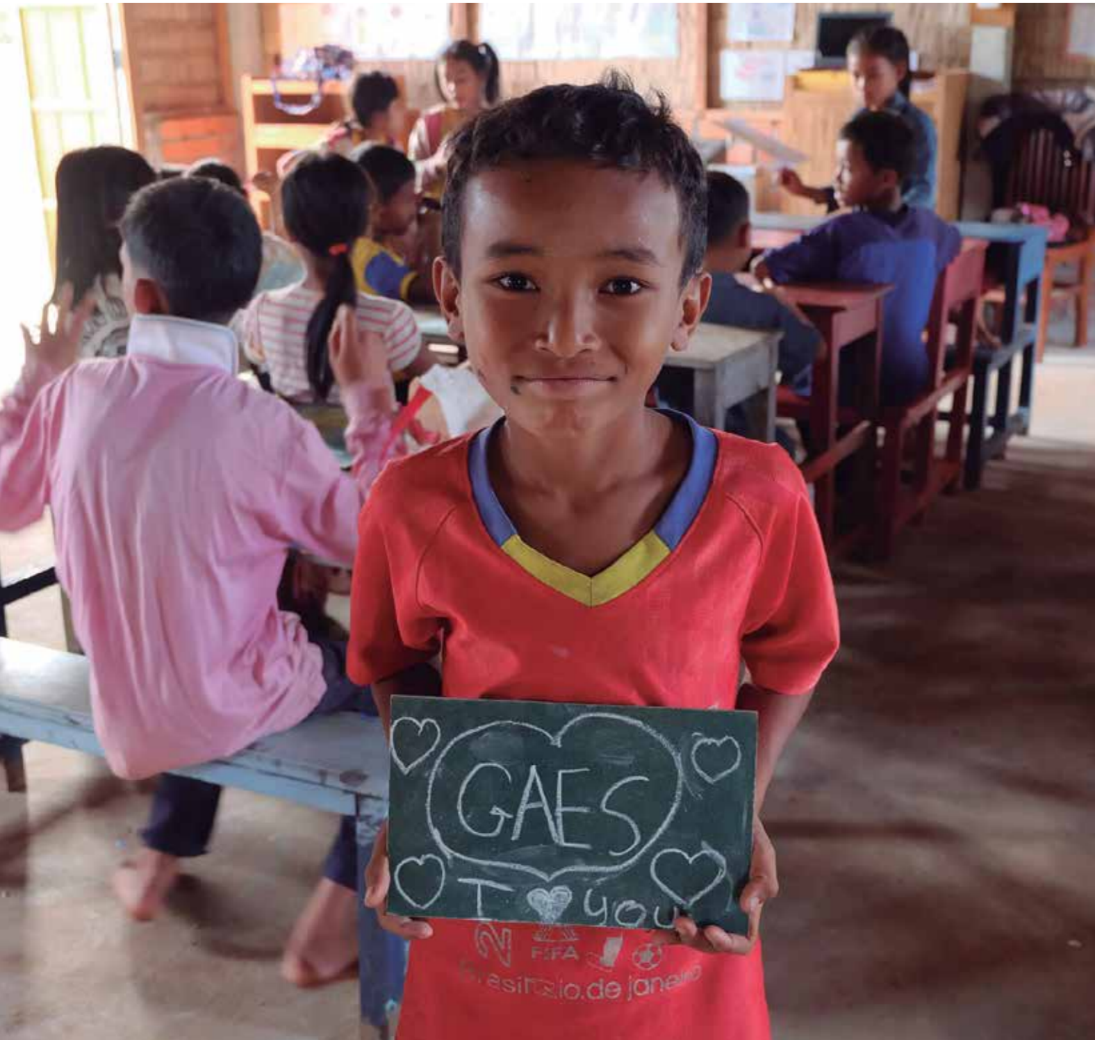
One of the children from the Camboya Sonríe school.