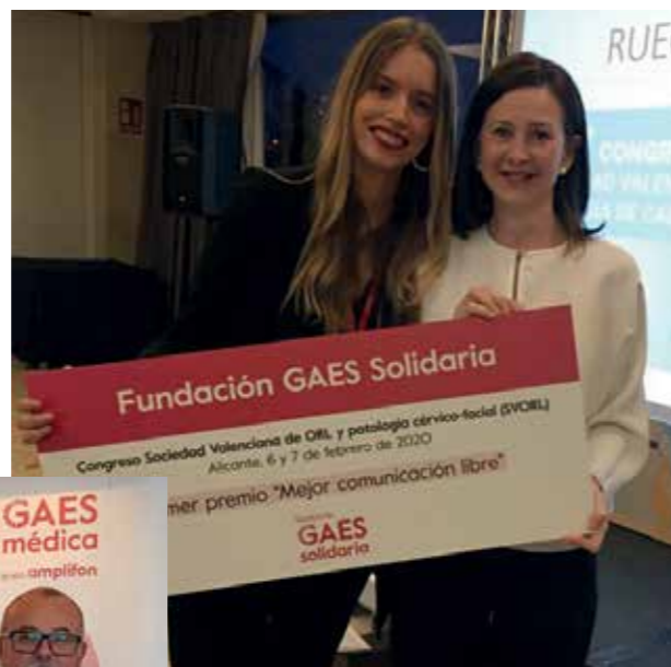
Presentation of the first prize in "Best free communication" by the GAES Solidaria Foundation at the congress of the Sociedad Valenciana de ORL

In 2020, the GAES Solidaria Foundation awarded €1,600 in 18 awards.