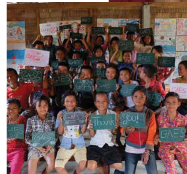
The children from the Camboya Sonríe school. Teaming Project