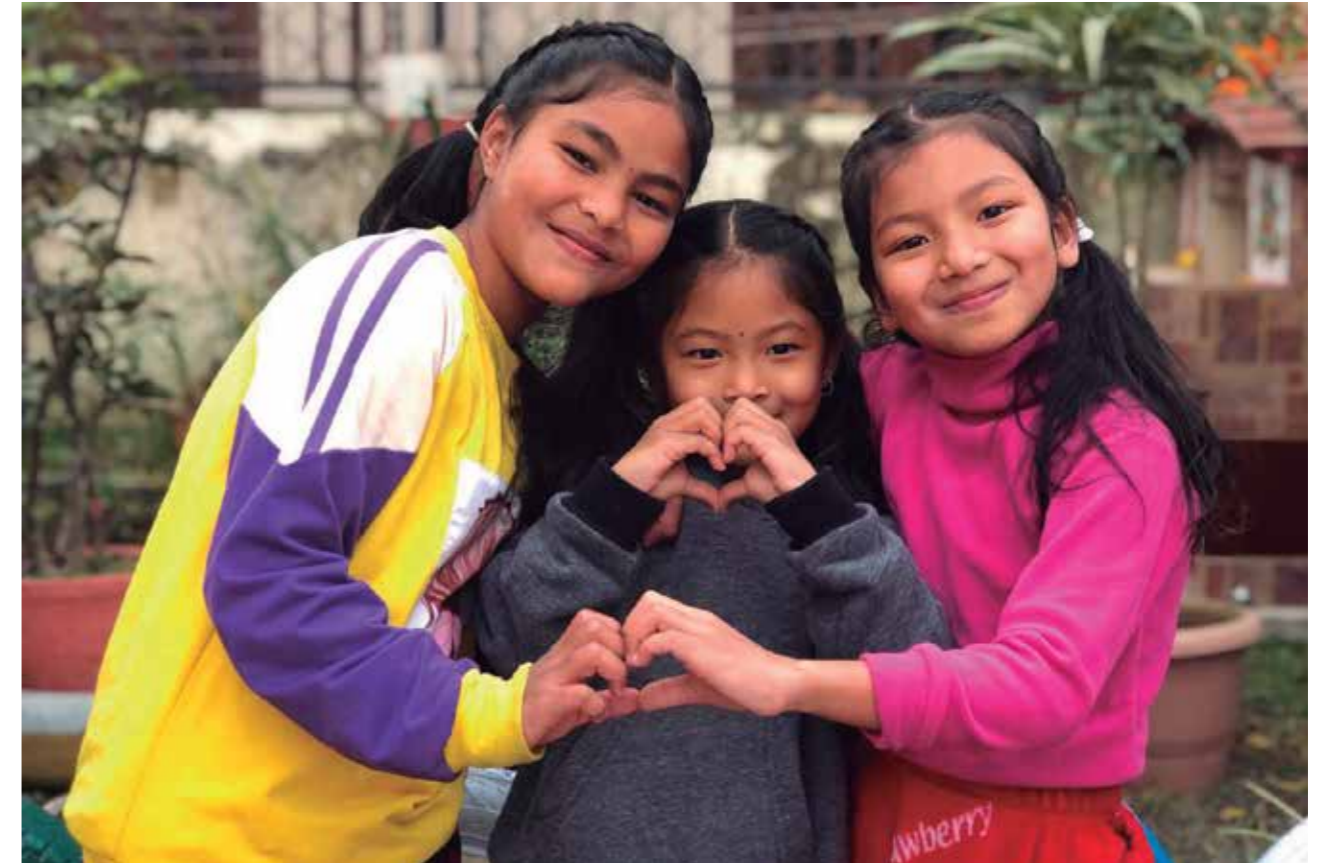
Girls from the NGO Dream Nepal

de Déu Hospital, ACAPPS (the Federation of Catalan Associations of Parents and Deaf Individuals) and the GAES Solidaria Foundation. On February 1st, 2020, the Orquestra Simfònica del Vallès premiered a piece composed by the JOGC through a series of workshops on composition for the young musicians.