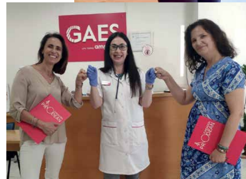
The presentation of the donation to the Prodean Mérida Foundation